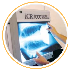
Integrated Film Scanner