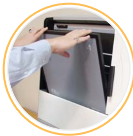
True Flat Scan Path