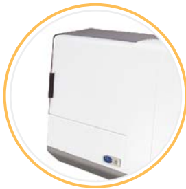
Patented Design Technology

The iCR2600's small footprint and the optional wall-mount makes it a perfect fit for small spaces or installation inside the X-Ray room for maximum productivity.